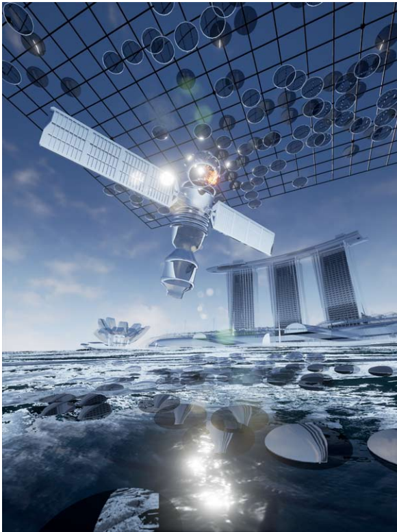
Image 4: Geomancer , Lawrence Lek, 2017

Images 4, 5 & 6 are available in landscape, portrait or square, upon request.