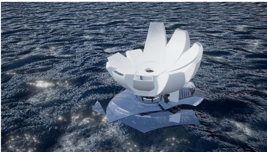
Image 6: Geomancer , Lawrence Lek, 2017